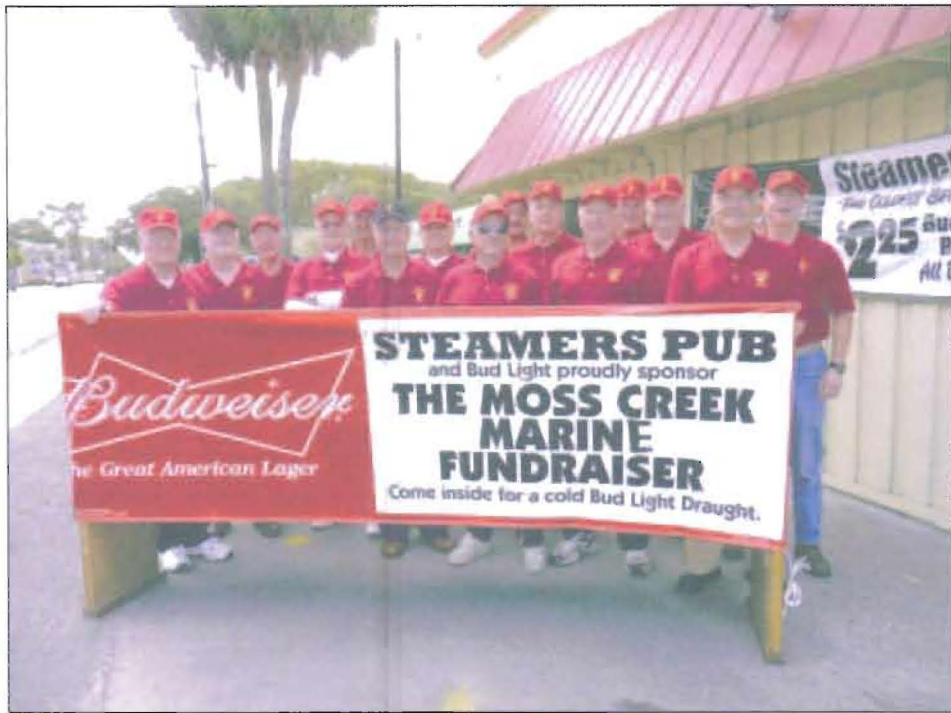
Special to Bluffton Today